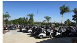
The golf carts are loaded with clubs and the players have gotten their box lunches and are getting ready for the noon tee off.