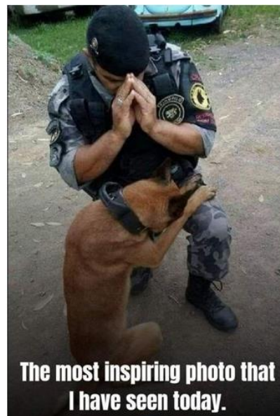
The most inspiring photo that I have seen today.