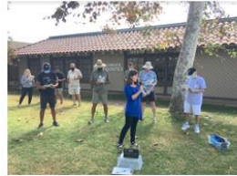
On the corner of Imperial Hwy and Santa Ana Canyon Road nearly 50 parishioners gathered to say the rosary while praying for peace. The passing traffic was loud, yet this gathering was spiritual and uplifting.

Next Recycle Saturday is on November 7 from 8am to 10am. Bring your plastic bottles and aluminum cans.