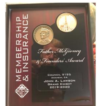
A close up of the award.