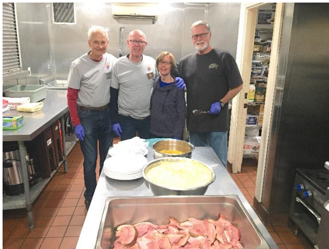
The Serving Team before the serving line starts.