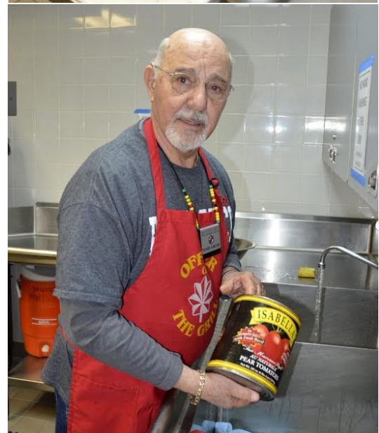
See "Italian Dinner" continued on page 13