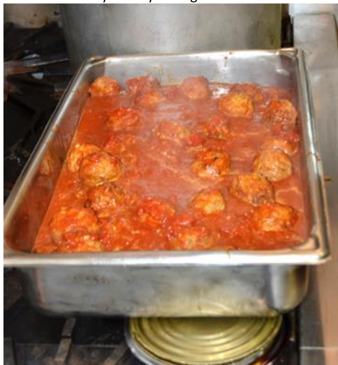
Meanwhile in the kitchen the meatballs are ready.