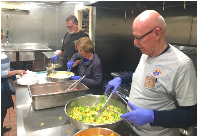
The Serving Team in action doing their thing with salad, ham and potatoes.