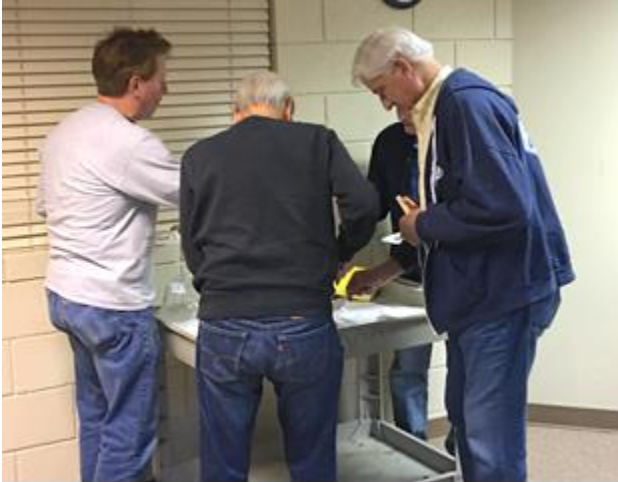
Bring the cake and ice cream and they will come.....