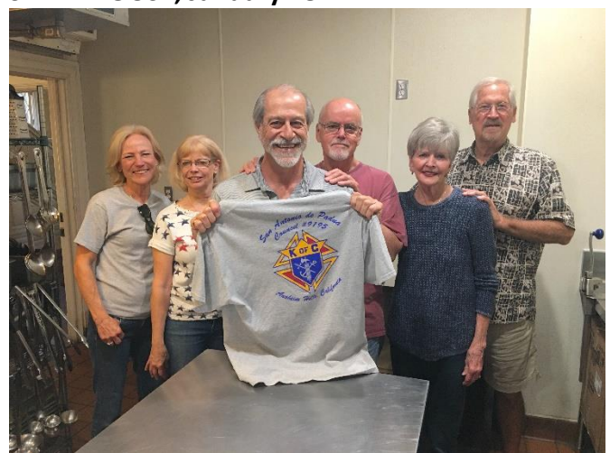
The Cooking Team, all done preparing a meal for the ladies of Isaiah House.