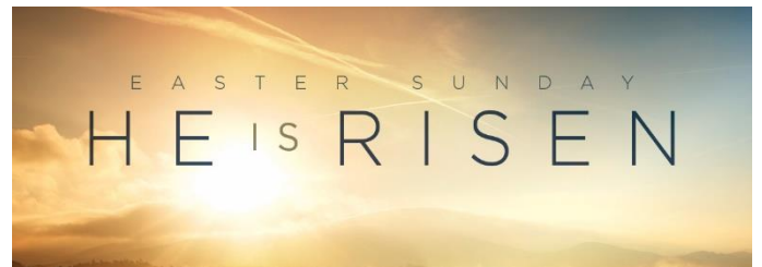
I pray all had a blessed Easter season. HE IS RISEN.