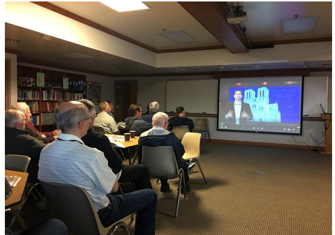
Men meeting early on Sunday morning to view a thought-provoking video by Paradisus Dei followed by individual table discussions. Always an uplifting and insightful experience.