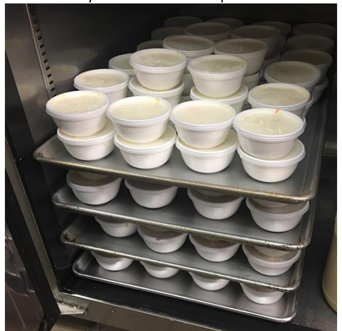
Thanks to the efforts of the Thursday afternoon team, the coleslaw is ready to be served on Friday's See "Happenings" continued on page 8