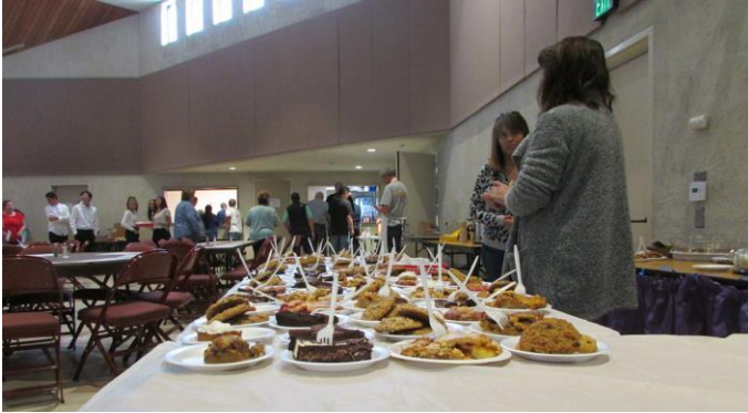
A look at the dessert table before the doors open.