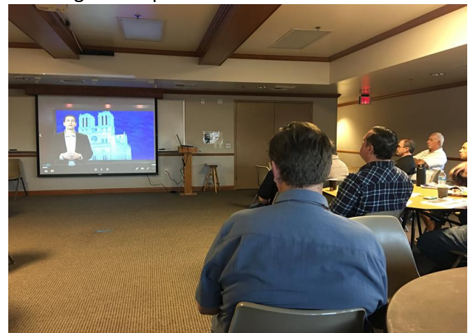
Many Knights attend this Sunday morning meeting. (And not just for the donuts....) Join in on Sunday mornings at 6:45am in the Multi-Purpose Room. To make it easy, you don't have to shave, you don't have to comb your hair (if you have any) but you do have to wear clothes.