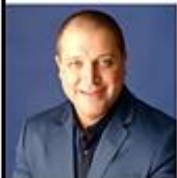
Knights of Columbus

1016 W. TOWN & COUNTRY RD. ORANGE, CA 92868 BUILDING A Email: gabcpa04@yahoo.com