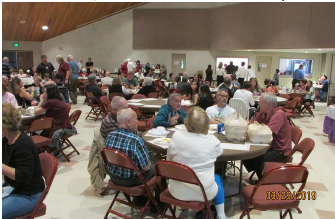
Another full house in Glynn Hall. Let the fellowship begin.