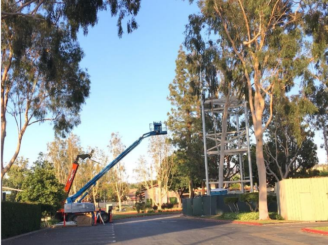
Progress is being made on the cell tower to the right.