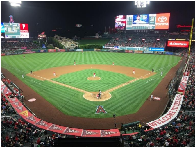
.....from the Mayor's suite. The tickets were won at the 28 th Annual Charity Golf Tournament Silent Auction. What a steal! Angels won too.