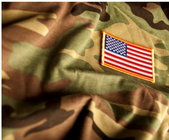
Lest we never forget our fallen Military men and women.