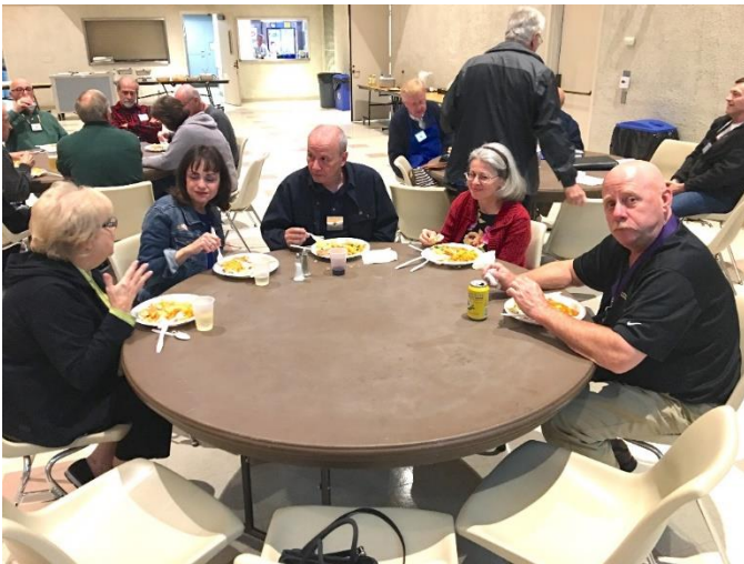
Enjoying the Cinco de Mayo dinner.