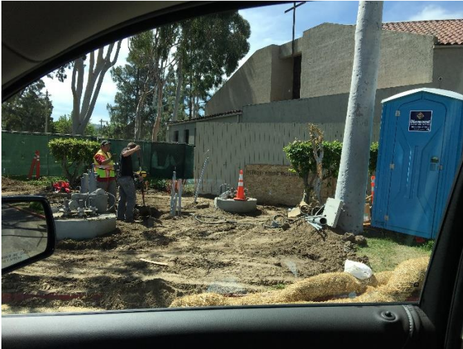
A drive by picture.