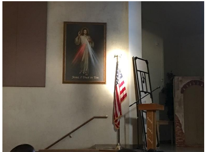
A light shines through a window in Glynn Hall during an early morning TMIY session. Inspiring, spiritual, emotional? Yes and even more so with the flag next to the Image of Divine Mercy of our Lord Jesus Christ. It states, "Jesus, I trust in you"