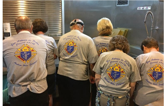
Guess who are wearing the K of C uniform of the day?