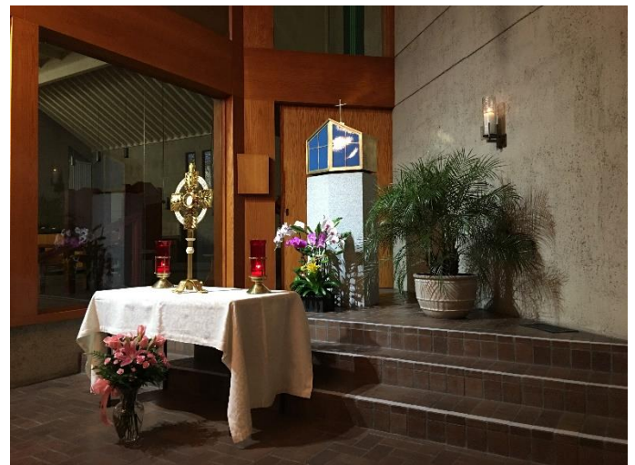
See "Happenings" continued on page 9

Eucharistic Adoration in our Chapel on Saturday, November 4, 2017 between 6am and 7am.