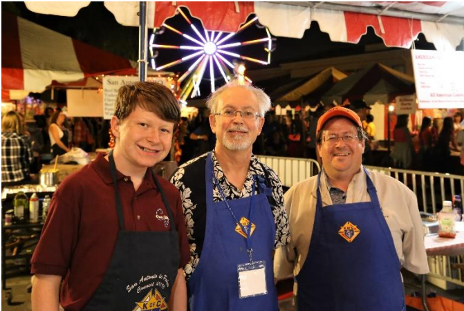
More members at the American food booth