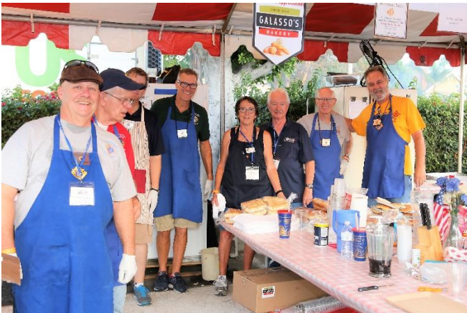
The American Food Booth run by the Knights and maned by the Knights and the Knights ladies