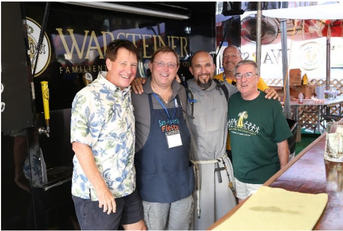
German beer booth crew