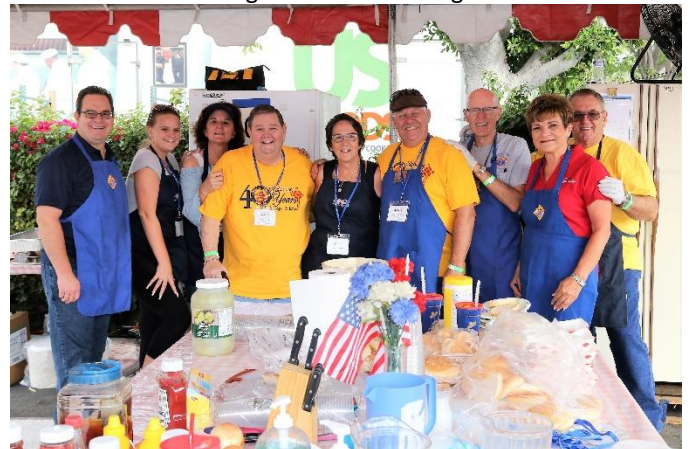
The American Food Booth run by the Knights and maned by the Knights and the Knights ladies