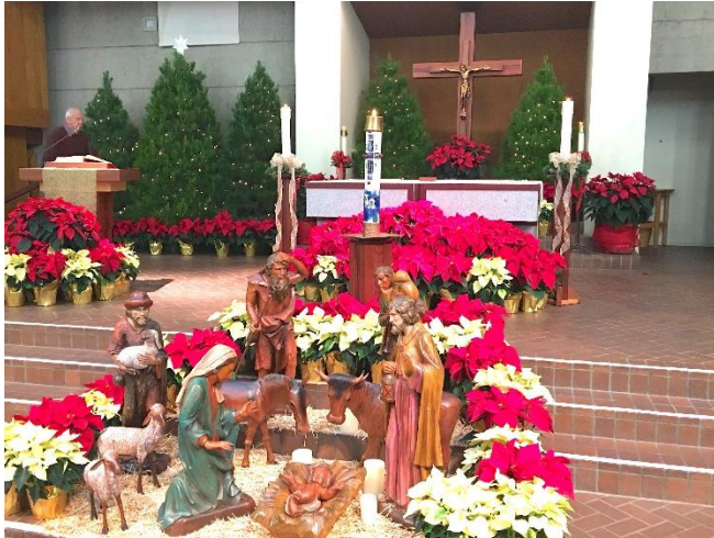
The Joy of Christmas

A special thank you is extended to all those who worked so diligently to decorate our altar to show us the birth of Jesus.